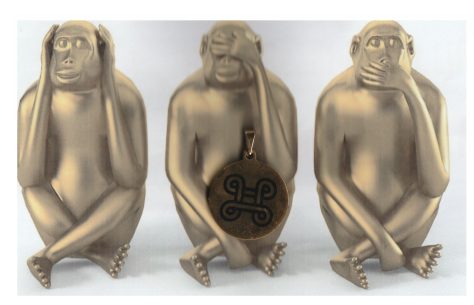
I do not believe that it is beyond your understanding to remain utterly blind to your irrationality.